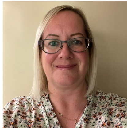
Technical Advisor - Land