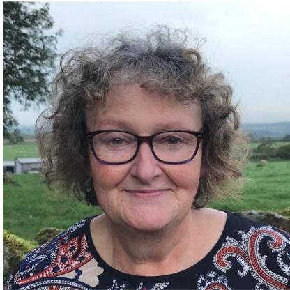
Industry Manager - Land